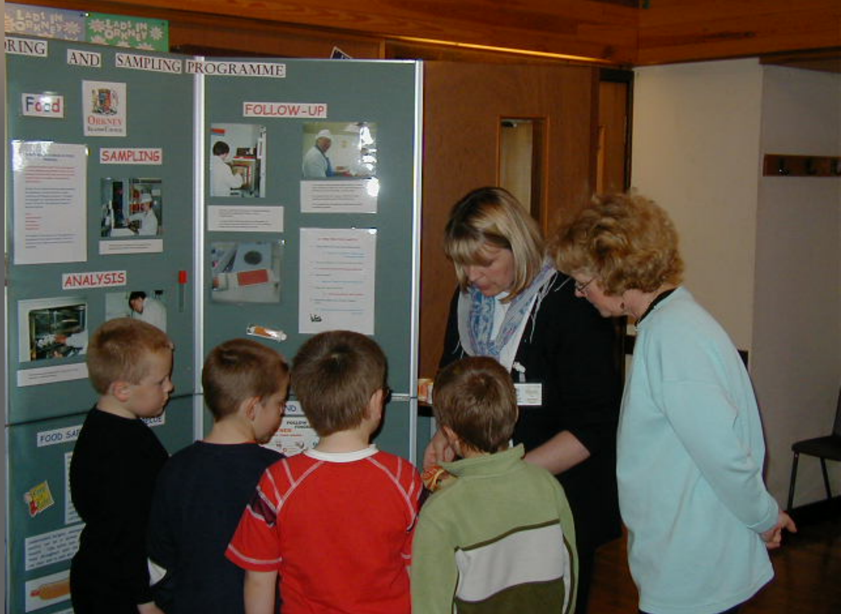
Food hygiene and bugs