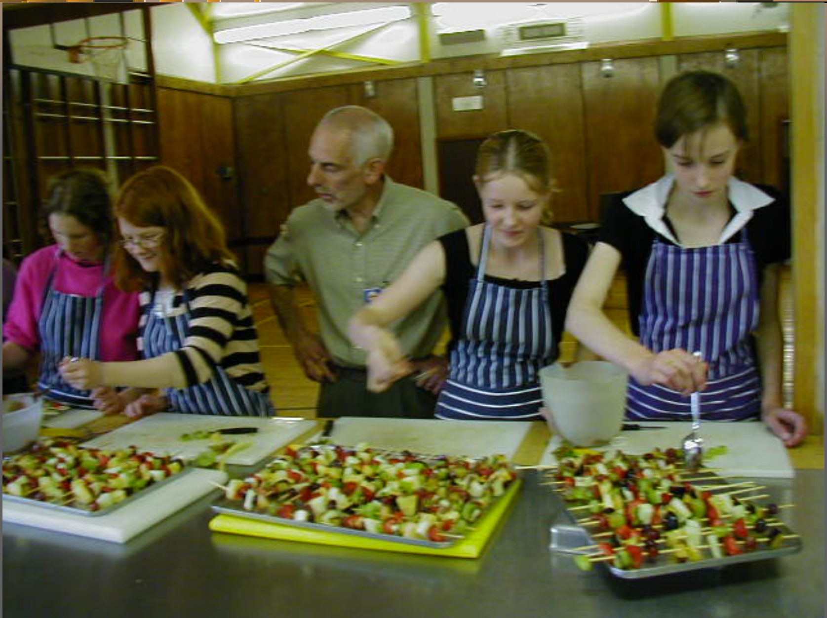
Young folk – food fun