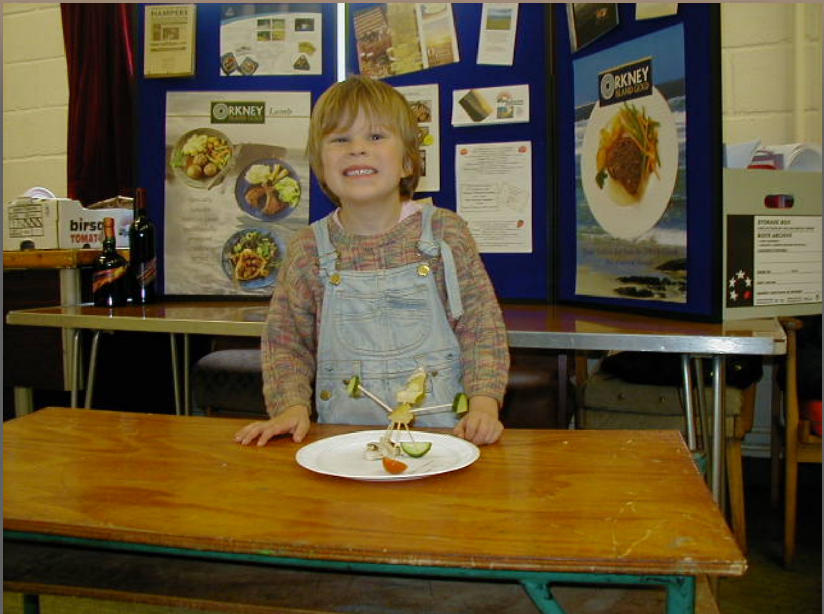
Wolfric's 'fruit bird'